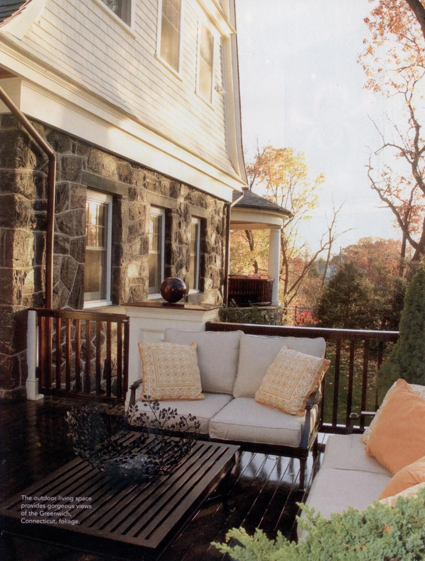
The outdoor living space provides gorgeous views of the Greenwich, Connecticut, foliage.